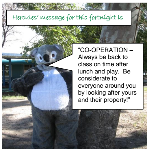
Hercules' message for this fortnight is